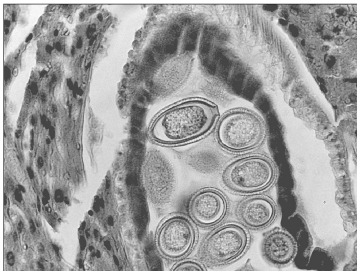
Figure 2. Elliptic and bioperculated ova, with polar eminence at each end, characteristic of C. hepatica .