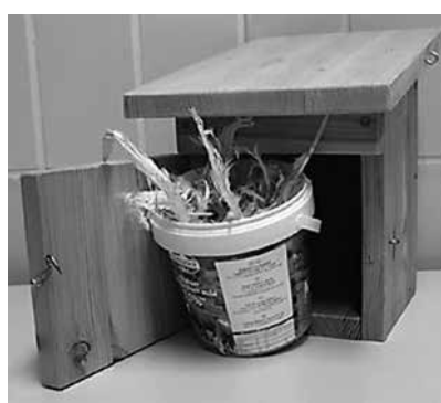
Figure 1. Artificial nest trap in modified wooden bird box to attract females of Tineola bisselliella . The plastic cup contained yeast soaked and oven dried goose quills, a substrate suitable for larval development and thus attractive to egg-laying females.