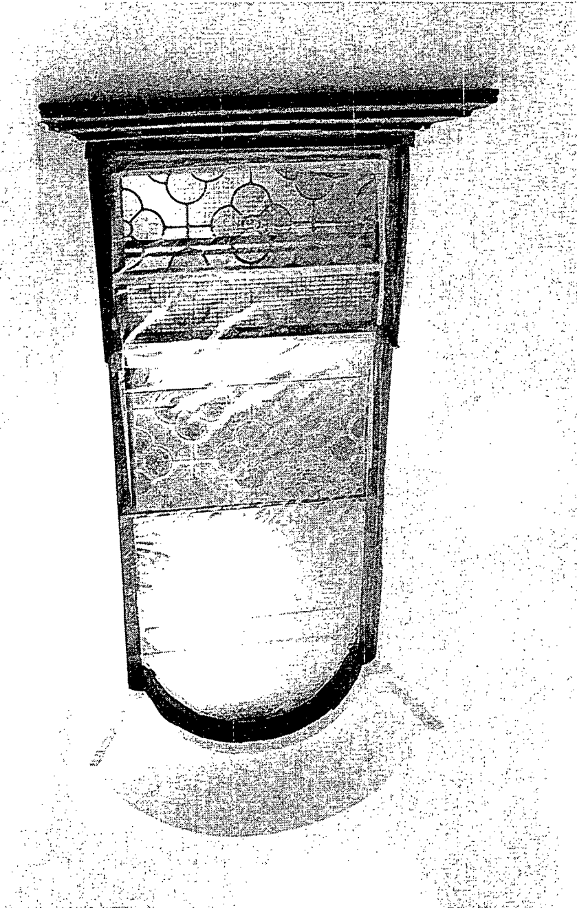
Fig. 3. A sealed window of the church to prevent gas loss

The required gas tightness of the church before fumigation was checked by "low pressure testing". For this a low pressure of approximately 10 Pa was generated in the church by a fan installed outside the church. The partial vacuum was stopped and the half loss time and pressure neutralization was measured. The determined half loss time was 3.6 seconds, indicating the structure was very "gas-tight"; therefore no emission problem for the neighborhood was expected to be created by the fumigation. The concentration of sulfuranyl fluoride outside the church was expected to stay below the threshold of 1 ppm. The initial dosage of sulfuranyl fluoride was calculated by means of a special calculator to give 36 g \text{SO}_2\text{F}_2/\text{m}^3 ( = 36 \text{ oz}/1000 \text{ ft}^3 ). The volume of the inside of the church (excluding the roof, which was