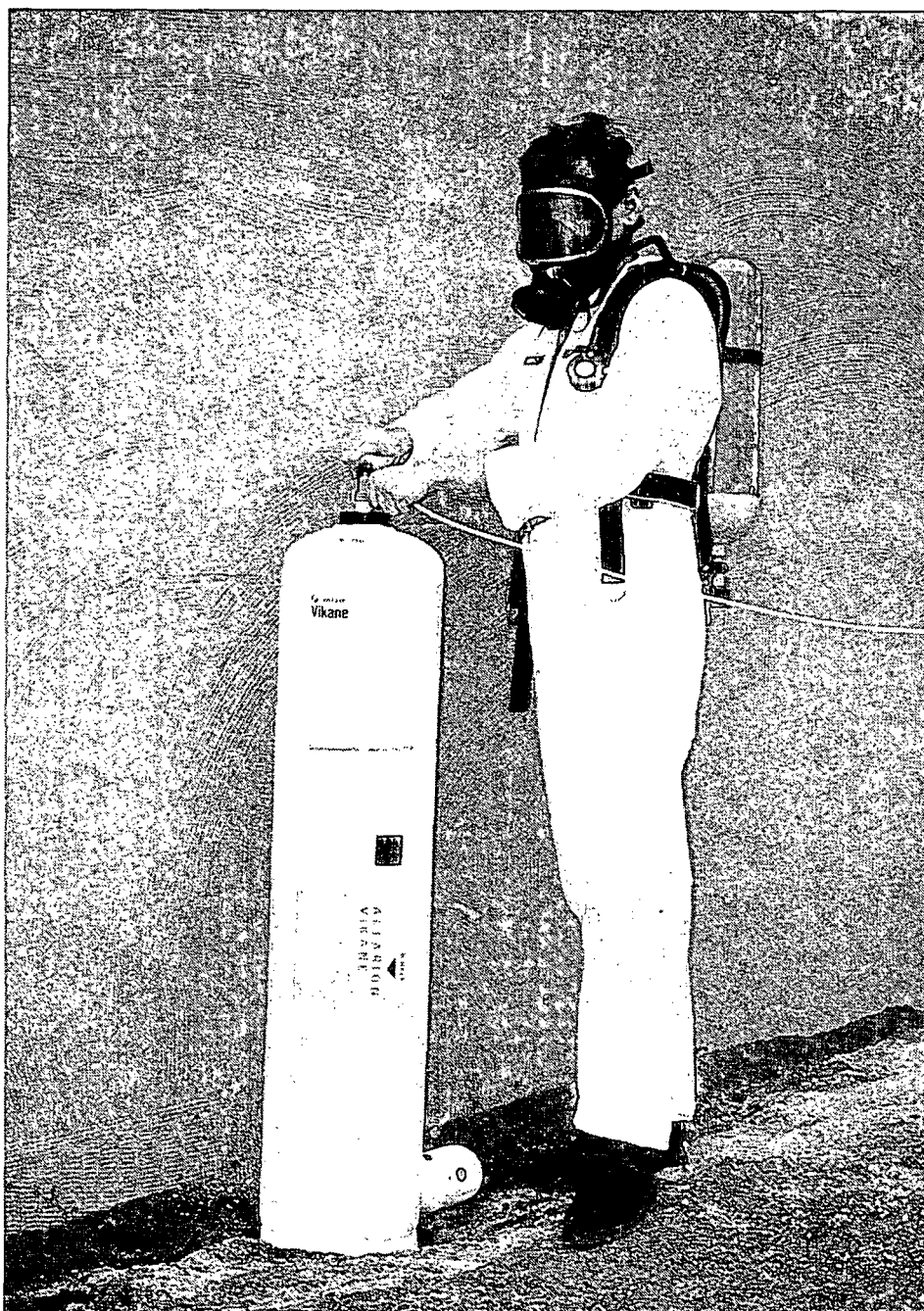
Fig. 4. Releasing the sulfuryl fluoride from the cylinder

not fumigated) was determined to be 1000 m 3 (ca. 35500 ft 3 ). The temperatures inside the church ranged from 6°C–9.5°C (42.8°F–49.1°F). These low temperatures are indicative of very difficult conditions for killing insects, because of their reduced rates of respiration. Thus, to determine the effectiveness of the fumigation, wooden blocks and metal cages with Anobiidae larvae were posted at various positions in the church.